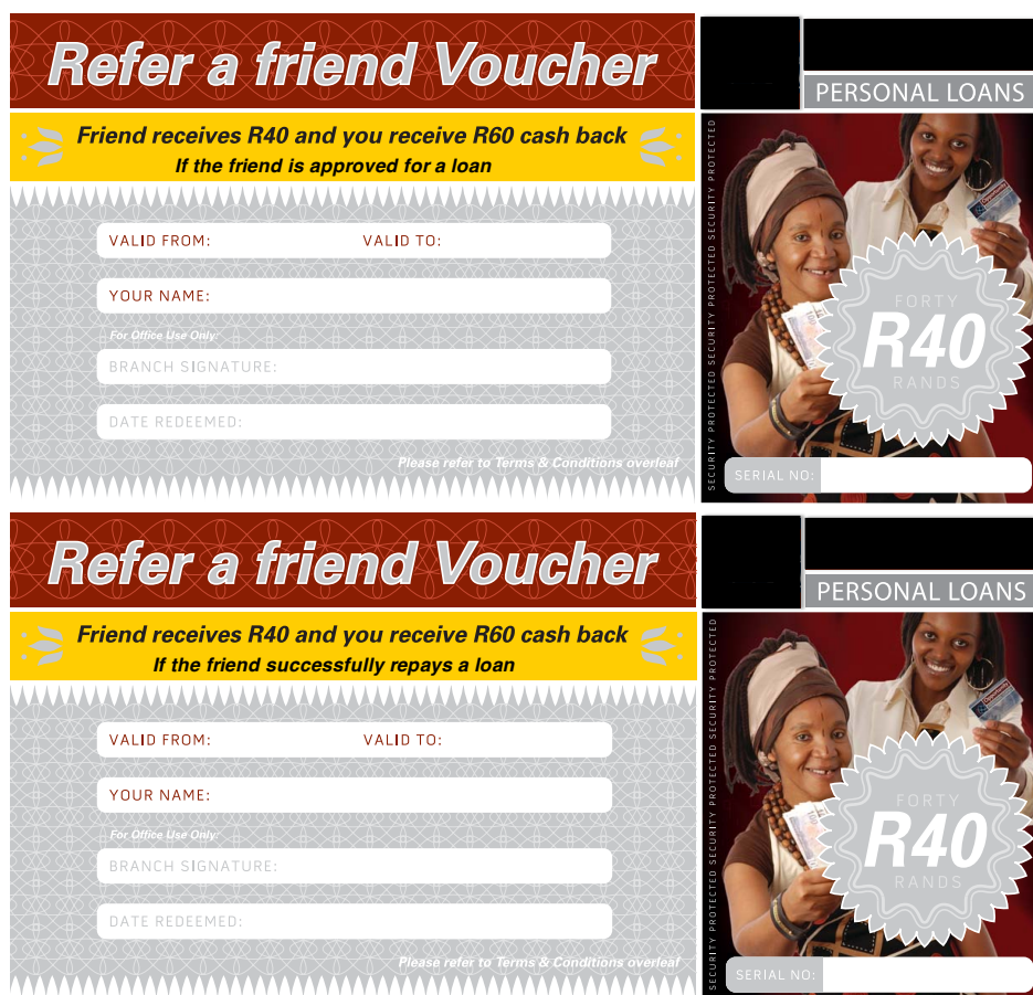
Figure 1: Referral Cards

change. Among referrers who had been given the ex-ante approval incentive, half were assigned to receive an additional ex-post repayment incentive. Opportunity phoned referrers in this group and told them that, in addition to the R100 approval bonus, they would receive an additional R100 if the referred repaid the loan. The other half of referrers who had been given the approval incentive ex-ante were contacted by Opportunity and reminded to pick up their R100 bonus. (Opportunity did not provide any new information on the incentive contract to these referrers, but we wanted referrers in both ex-post arms to receive a phone call from Opportunity in case the personalized contact from the lender had some effect.)